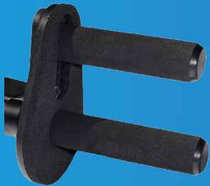
2-Point Handle (push = brake / pull = accelerator)