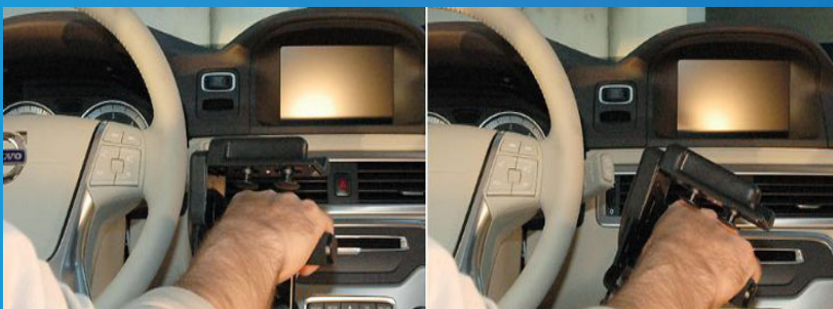
Closed throttle CL002B Handle

Auxiliary control buttons can be activated with flexion of the wrist, no finger dexterity required. Voice command is also available to function indicators, lights, wipers and horn.