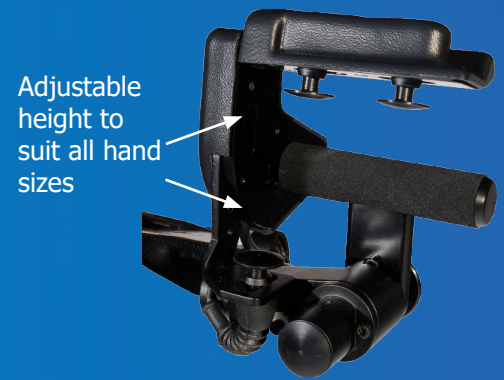
Adjustable height to suit all hand sizes